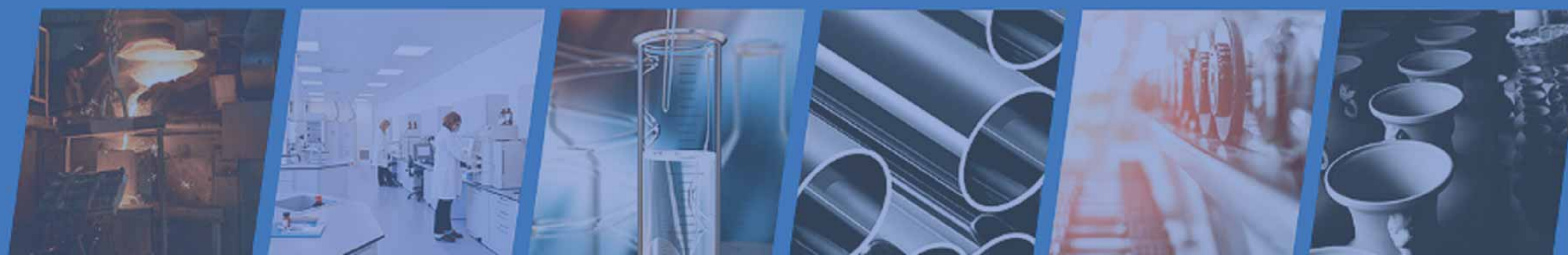
● Industrial / mining enterprises ● Laboratory ● Scientific Research Units ● Small Steel Quenching ● Metal ● Ceramic

The box-resistance furnaces used in element determination and heating in heat treatment of steel, such as hardening, annealing and tempering of laboratories, industrial mining enterprise, scientific research unit and colleges. The high temperature muffle furnace could be used in high temperature heating of metal, sintering, dissolution and analysis of ceramic.